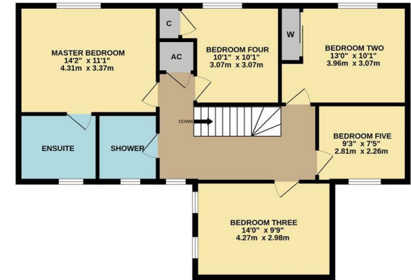
TOTAL FLOOR AREA: 2014 sq.ft. (187.1 sq.m.) approx.

Whilst every attempt has been made to ensure the accuracy of the floorplan contained here, measurements of doors, windows, rooms and any other items are approximate and no responsibility is taken for any error, omission or mis-statement. This plan is for illustrative purposes only and should be used as such by any prospective purchaser. The services, systems and appliances shown have not been tested and no guarantee as to their operability or efficiency can be given. Made with Metropix ©2024